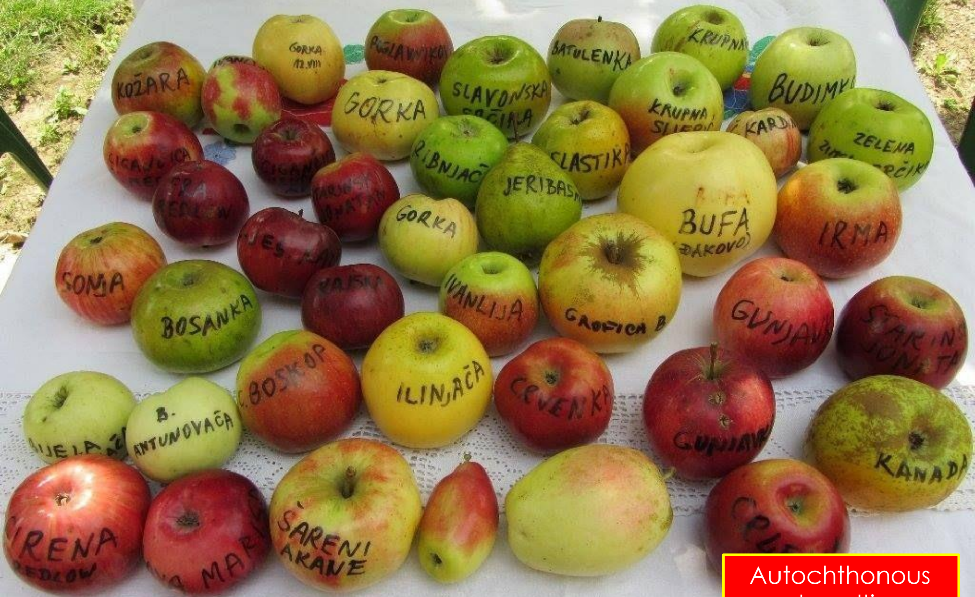
Autochthonous apple cultivars